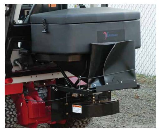
Drop Curtain flips up when not in use.

328 East Water St • PO Box 148 • Orrville, OH 44667 Pphone: 1-866-VENTRAC (1-866-836-8722) • Fax: 330-683-0000