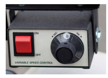
Variable Speed Electronic Controls

An optional Drop Curtain is available for spreading material in tight quarters such as sidewalks, parking garages and more. The new flip-up design allows for easy storage when using spreaders in larger areas. Fits both SS575 and SS300 spreaders.