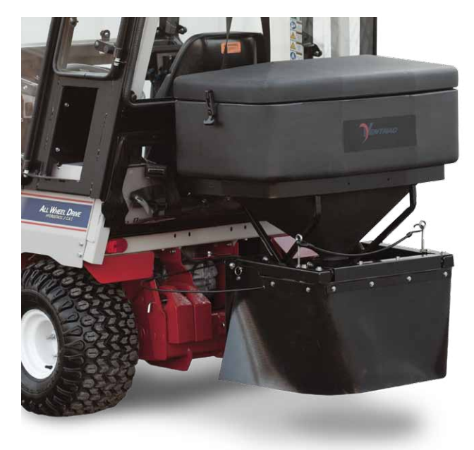
Optional Drop Curtain

All specifications subject to change without notice or obligation