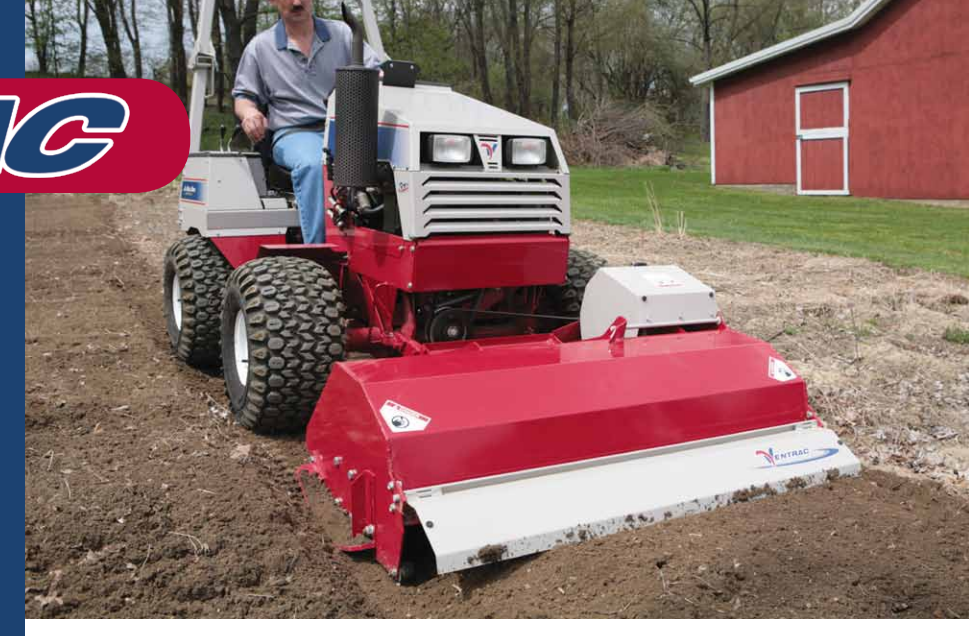
Ready for spring: Turn hard soil into an airy garden bed.