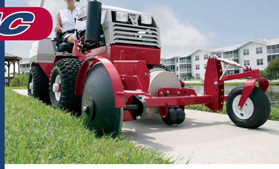
Edge Perfection: The Ventrac Edger leaves your sidewalks, trails, and paths looking sharp.